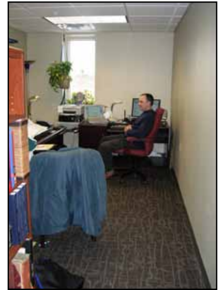
Before and after images of Dr. Duval's office.

The process continues, as a collaborative effort between the client, myself and the phenomenal world, working together to achieve a harmonious design, using mindfulness and awareness to refine the vision and bring all elements into balance.